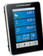
1 Weighing electronics